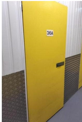
Dublin Unit Door A36