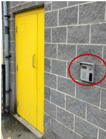
Dublin Depot Door