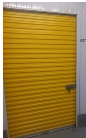
Waterford Unit G97