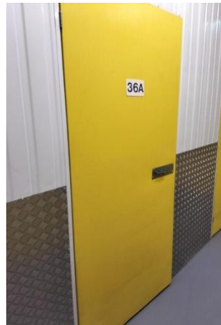
Dublin Unit Door 36A