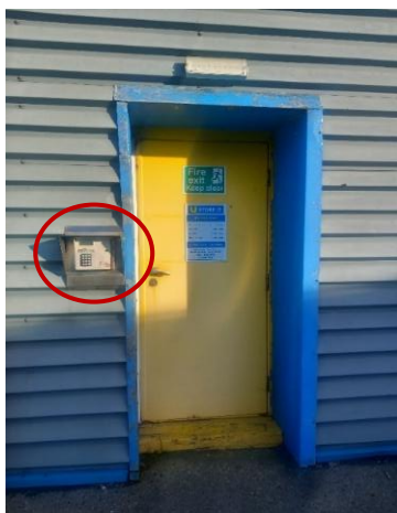
Waterford Depot Door